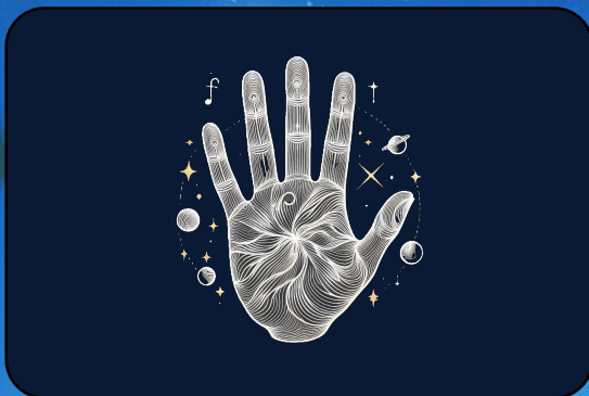
Your Left Palm